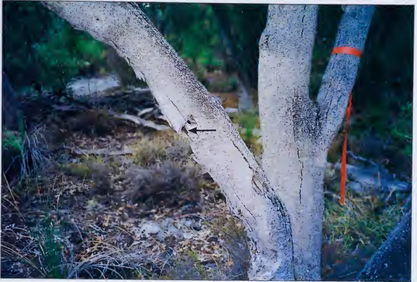
Figure 1. Typical N. geoffroyi roost found in dead Banksia tree. Roost (marked with arrow) was 0.8 m above ground. Width of central branch was 0.32 m.

There was a significant and positive relationship between T_a and T_r in both Banksia and Melaleuca trees ( r^2=0.78 , f_{2,54} = 199.6 , p = 0.0001 and r^2 = 0.81 , f_{2,13} = 55.9 , P = 0.0001 respectively). However, the slope of the line describing the relationship between T_a and T_r for Banksia roosts was significantly greater than that for roosts in Melaleuca trees (test of slopes: t_{67} = 5.6 , P < 0.001 ) and at T_a s above about 16^\circ\text{C} the temperatures in Banksia roosts was always greater than those in Melaleuca . In addition, in Banksia trees T_r typically approached T_a by about 1200 and by the time final temperature measurements were taken (between 1600 and 1700 ) five of six roosts in Banksia had temperatures that exceeded ambient by about 1.0^\circ\text{C} (range 0.3\text{--}1.7^\circ\text{C} ; Fig 3). The temperature of roosts in Melaleuca trees never exceeded T_a during the measurement periods (Fig 3).